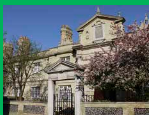
Bishop Duppa's Almshouses