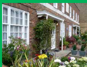
Queen Elizabeth's Almshouses