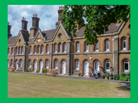
Church Estate Almshouses