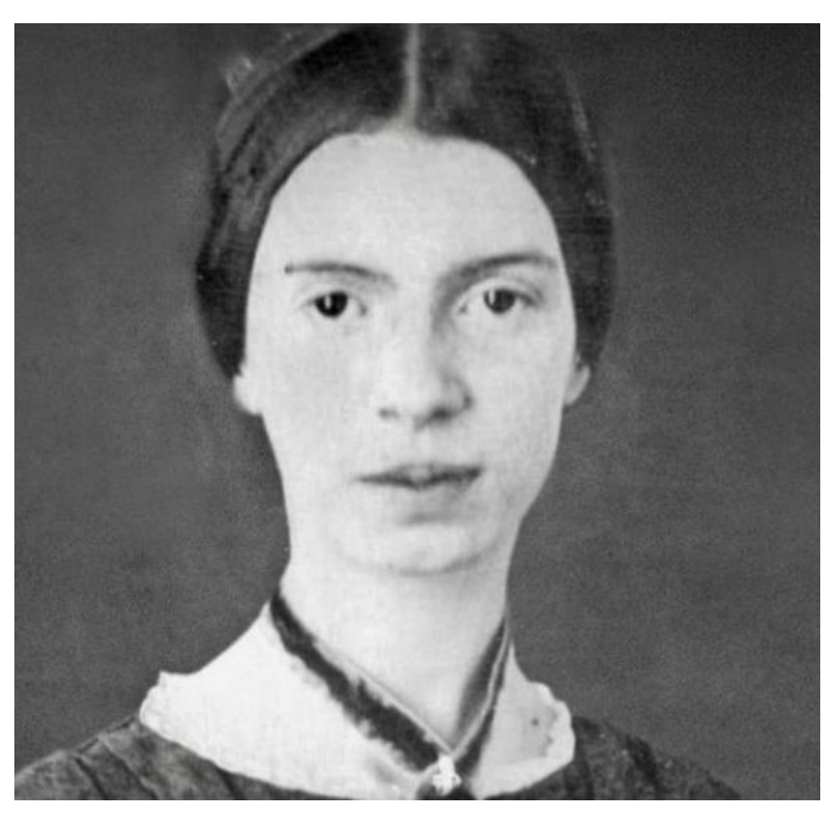
Emily Dickinson

This, by the way, is an easy poem to learn off by heart, if you feel so inclined.