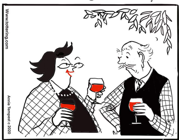
"It's just that I find that having two glasses of wine at once stops me touching my face..."